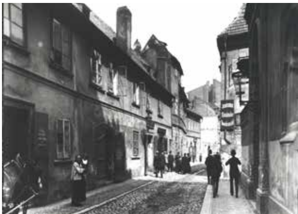
View along Dušní street in Josefov (1911)

As in Josefov, significant changes took place throughout Prague. Many Jewish families settled in Vinohrady, Smíchov, and Karlín , although they dispersed to virtually all Prague suburbs at the time. The 'royal' Vinohrady quarter of the late 19th Century saw the building of a monumental Synagogue, the largest in the Hapsburg monarchy . A much more modestly-scaled oratory was built in the Smíchov district. While the Vinohrady Synagogue was destroyed by bombing in the last months of World War II, the Smíchov Synagogue has survived to this day.