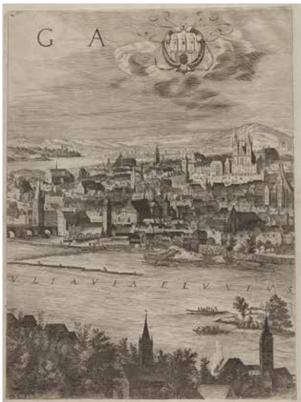
Prague – Old Town (1606)

The loyalty of Prague Jews was abundantly shown during the siege of Prague by the Swedes at the end of the Thirty Years' War, greatly helping to repel the would-be invaders.