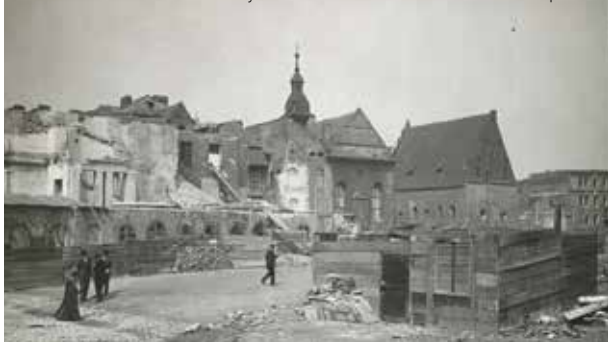
House demolition in today's Pařížská street in the Josefov redevelopment

As in Josefov, significant changes took place throughout Prague. Many Jewish families settled in Vinohrady, Smíchov, and Karlín , although they dispersed to virtually all Prague suburbs at the time. The 'royal' Vinohrady quarter of the late 19th Century saw the building of a monumental Synagogue, the largest in the Hapsburg monarchy . A much more modestly-scaled oratory was built in the Smíchov district. While the Vinohrady Synagogue was destroyed by bombing in the last months of World War II, the Smíchov Synagogue has survived to this day.