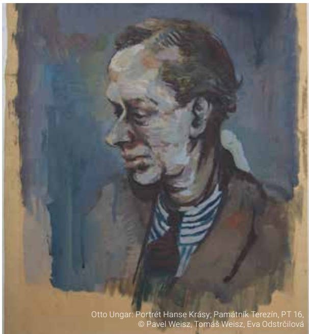
Otto Ungar: Portrét Hanse Krásy; Památník Terezín, PT 16

In 1942 during the Nazi occupation, Krása was deported to the Terezín camp, where he greatly promoted cultural life. With the children there, in arduous conditions, he staged the cheerful opera Brundibár , which ran to over 50 performances. The show paradoxically appeared even in Nazi propaganda footage, The Führer gives the Jews a City , which very tendentiously portrayed the conditions in Theresienstadt, making it out to be some sort of Jewish spa town. Krása's artistically fruitful life was extinguished in 1944 in Auschwitz.