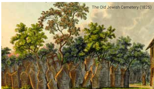
The Old Jewish Cemetery (1825)

Perhaps the fact that Jews came to Prague from different places helped the formation of two distinct centres of Jewish settlement . One around the Old School (today's Spanish Synagogue) and the other by the Old-New Synagogue. This was the real heart of the medieval Jewish ghetto. The merging of the two settlements was obstructed by the Benedictine enclave of St George at Prague Castle that included the Church of the Holy Spirit, whose Gothic profile can be seen right by the Spanish Synagogue.