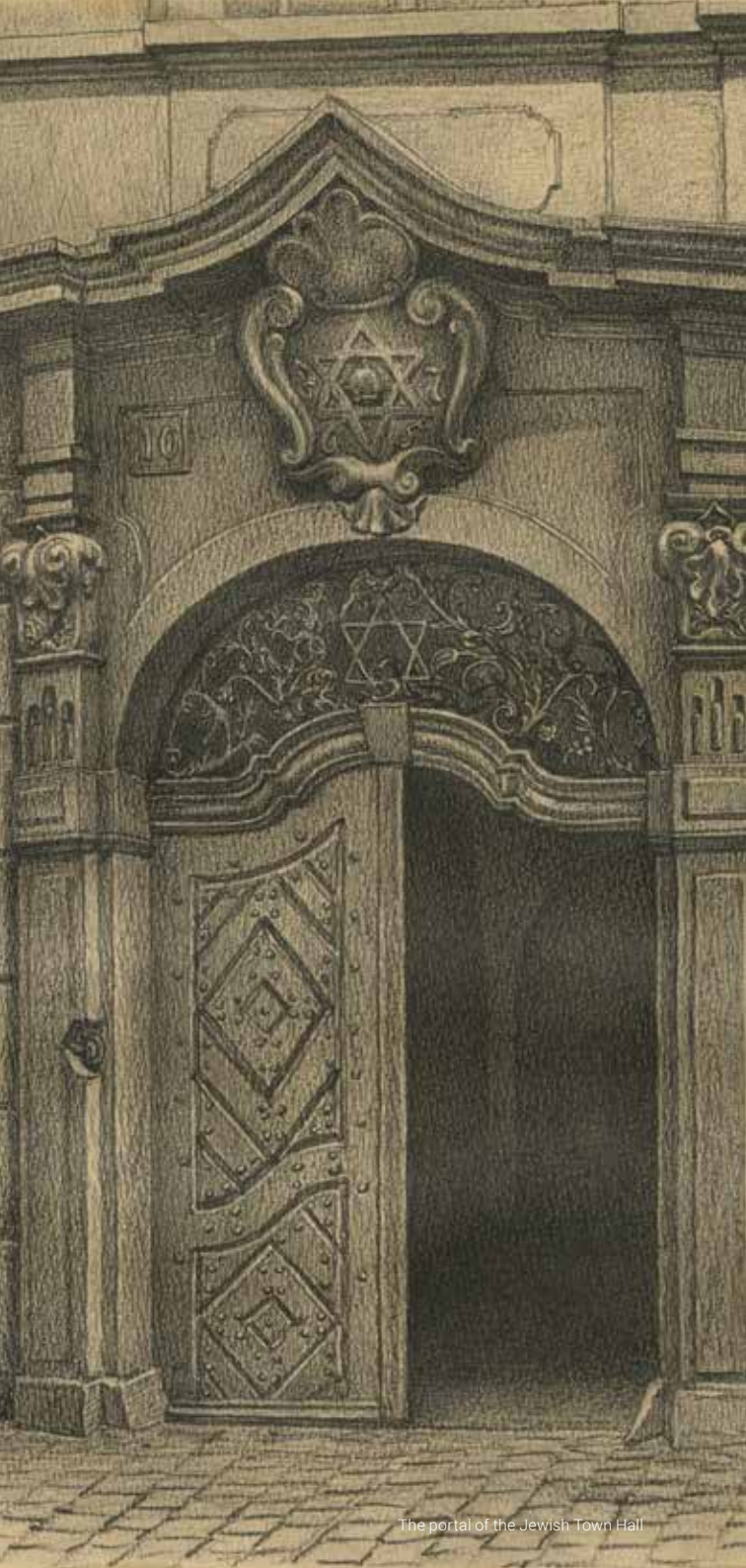
The portal of the Jewish Town Hall