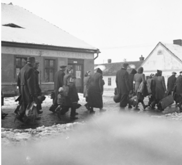
World War II transport of Jews passing through Bohušovice en route to Terezín (winter 1941 or 1942)

In democratic prewar Czechoslovakia, the Jews enjoyed civic equality, mostly assimilated into society. All of this changed with the Munich Agreement and the Protectorate of Bohemia and Moravia . So-called Nuremberg laws were introduced, allowing the legalized persecution of Jews : stripped of property, of options to exercise their profession, gradually excluded from all areas of civic life. Their registration and humiliation, tagging with the Star of David was a prelude to mass deportations and the 'final solution' of the Jewish question . The Terezín ghetto became a transit way-point on a journey to oblivion for most Czech and Moravian Jews. From here, trains took them to ghettos, concentration camps and extermination centres in the East – the territory of the 'Generalgouvernement'; Latvia, Estonia and Belarus. The fate of Prague's Jews was no different. Most of the 44,000 Prague Jews fell victim to Nazi racial policy. They are commemorated by the Czech and Moravian Jewish victims of Shoah memorial in the Pinkas Synagogue.