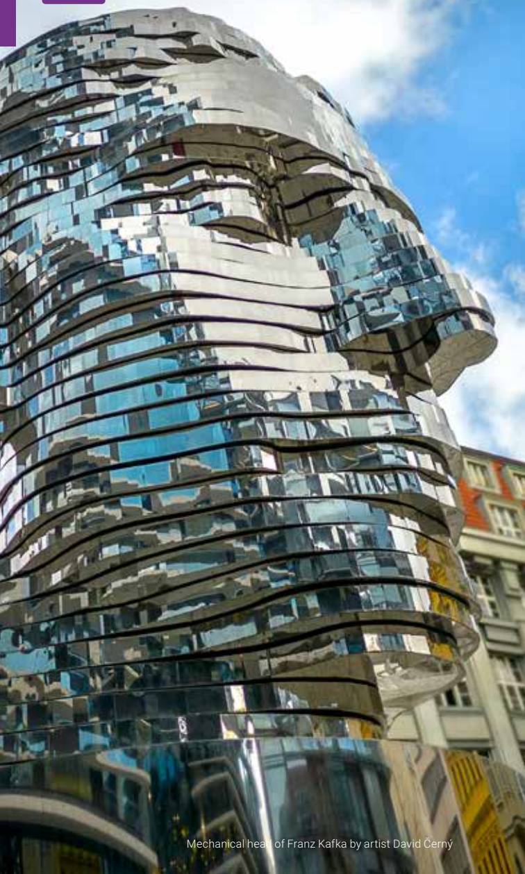
Mechanical heart of Franz Kafka by artist David Černý