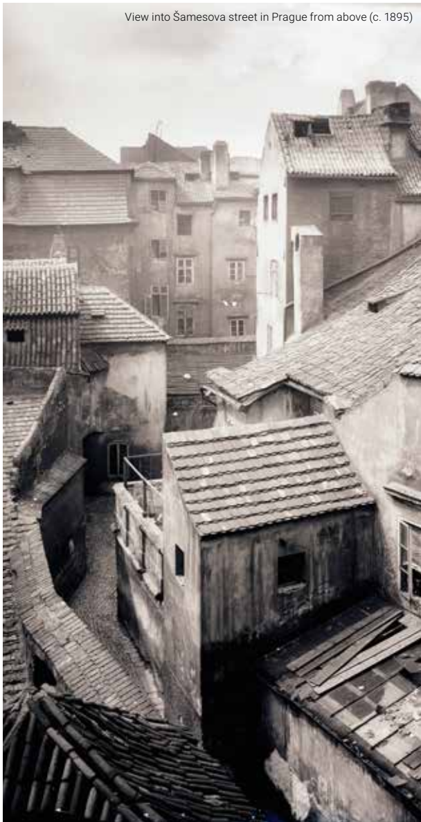
View into Šamesova street in Prague from above (c. 1895)

Prague's Jewish history is richly diverse. Indeed, it represents more than a thousand years of Jewish presence in Prague , lasting to this day.