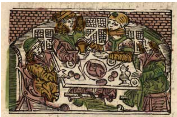
A family at the table (grace after a meal): an illustration from Seder zmirot u-virkat ha-mazon, Prague, 1514; photo: © Jewish Museum in Prague

Classic Jewish dishes include the gefilte fisch – chopped deboned fishmeat (typically carp) made into flattened cakes, slowly poached in broth, served chilled. Another traditional Jewish meal is cholent (or hamin). This classic Shabbat dish consists of stew that is prepared on Friday and allowed to cook slowly overnight until Saturday. Basic cholent contains meat, potatoes, pearl barley and beans. Traditional sundries are kishkeh (sausage casings stuffed with a mixture of flour and onion), kneidlach (dumplings) or kugel (pudding).