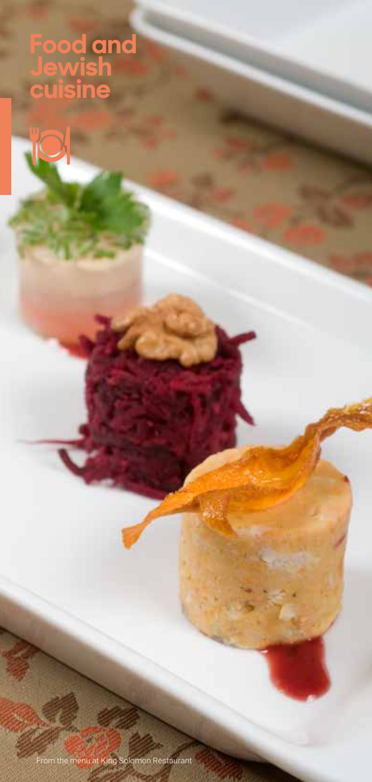
From the menu at King Solomon Restaurant