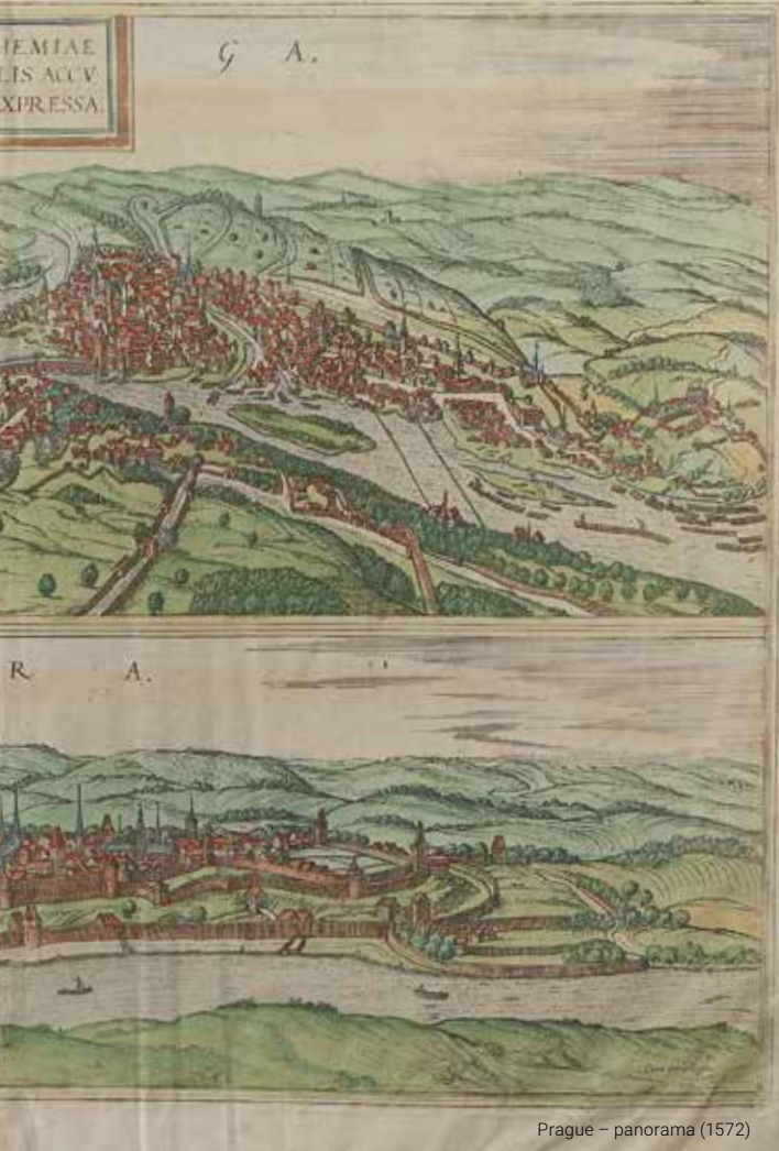
Prague – panorama (1572)